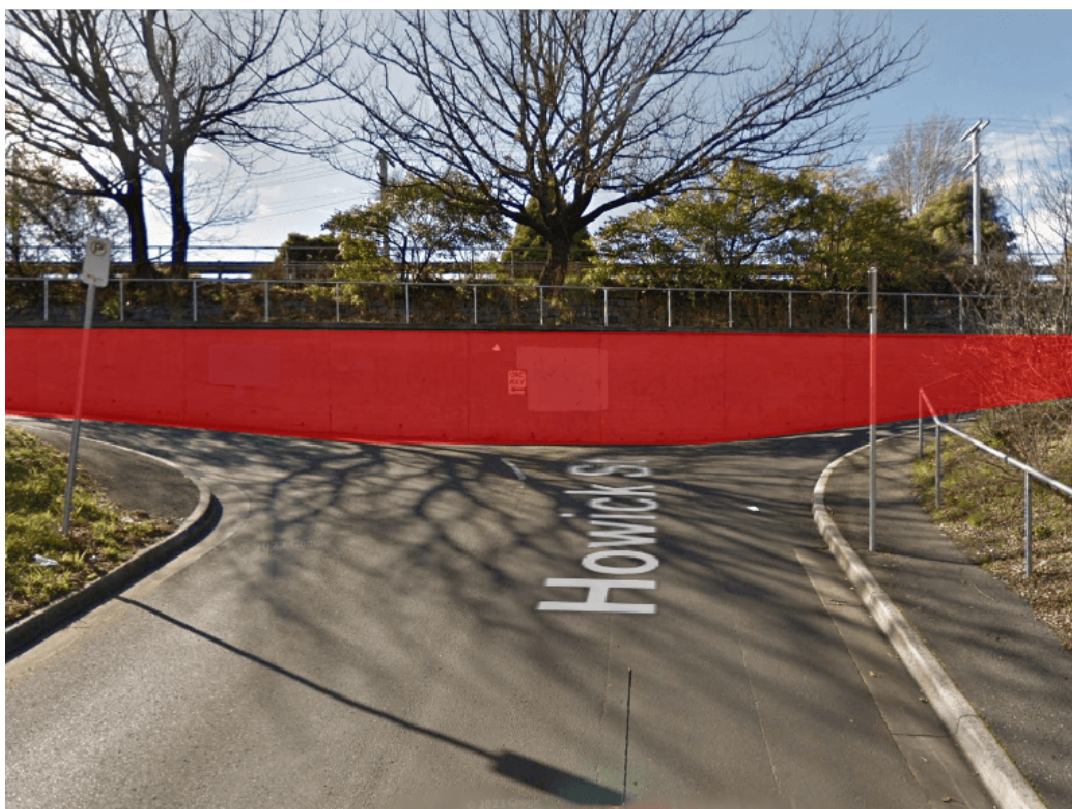
Figure 4 - Howick Street (as seen on ascent)