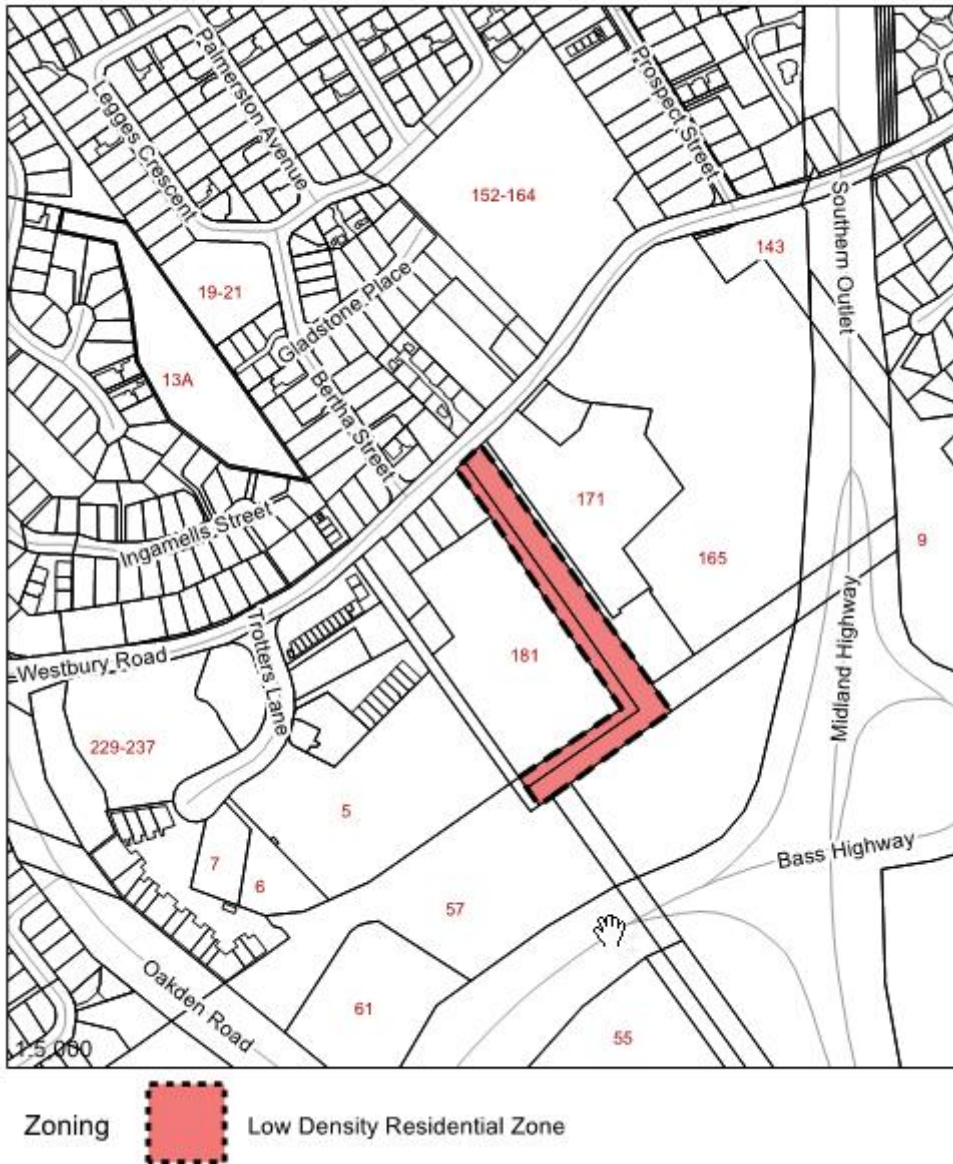
Figure 1 - Instrument to Certify